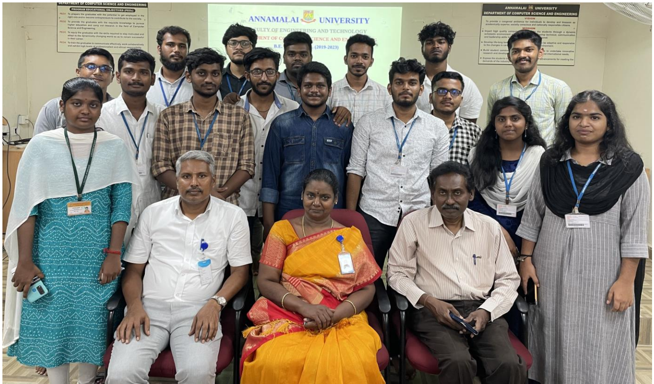
B.E. CSE (AI & ML) PLACED STUDENTS