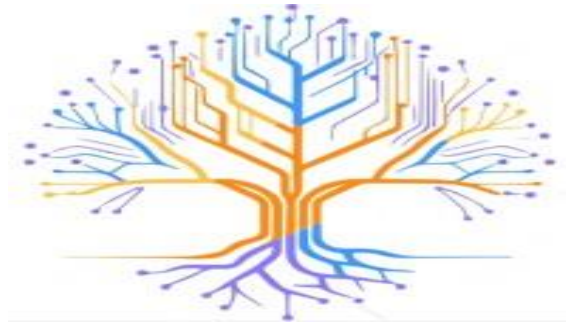
Turing Networks.ai 1

Turing Networks is a cutting-edge AI-based product and service company that focuses on Biomedical and Healthcare Analytics, AR/VR, Image Processing, Deep Learning, Business Analytics, and another AI solutions optimization. We provide advanced solutions that harness the power of Artificial Intelligence, Natural Language Processing, and IoT to deliver accurate and actionable insights for various industries, including healthcare providers, research institutions, pharmaceutical companies, and more. Our team of experienced AI engineers, data scientists, and healthcare professionals are dedicated to developing innovative technologies that help improve outcomes and streamline operations. Whether it's developing AI-powered diagnostic tools for healthcare providers, optimizing business processes using machine learning, or applying computer vision techniques to image analysis, we strive to make a positive impact on society through the power of AI.