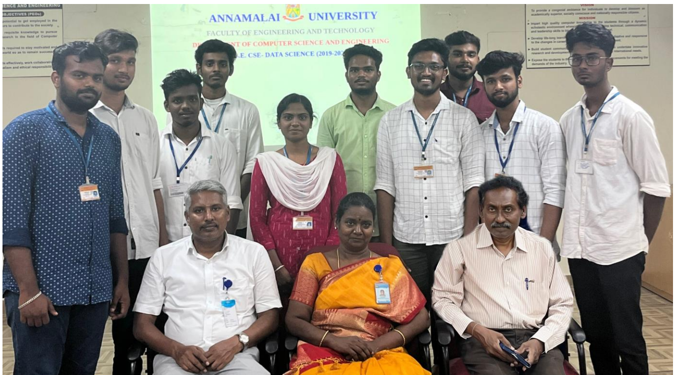
B.E. CSE (DATA SCIENCE) PLACED STUDENTS