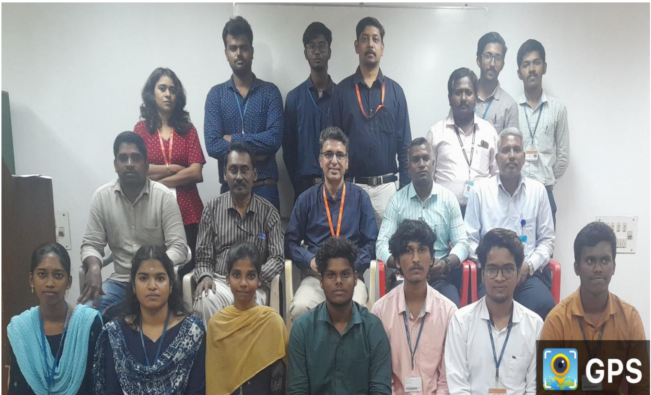
Azentio Software Private Limited's On-Campus Recruitment Drive was held on 30.01.2023 at the Training and Placement Cell, Faculty of Engineering and Technology, Annamalai University. The placed students are being with the HR team of Azentio and Training and Placement Officer.